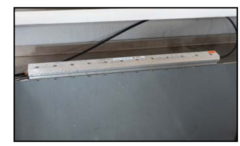
24" air knife blows excess water from parts

I-SERIES SPRAY OFF CABINET WASHER VIDEO DEMO ▶