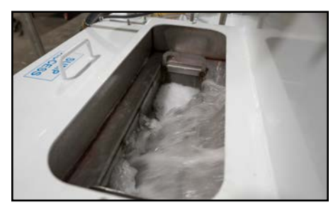
Debris trays catching debris above the water level

I-SERIES TOP LOAD SPRAY OFF CABINET WASHER Rev. 10-2022 Subject to changes and modifications without notice.