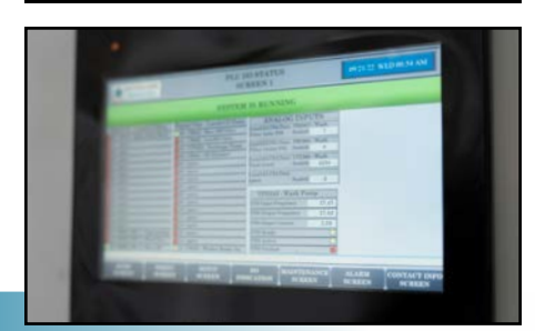
Large, user-friendly HMI/PLC Control Panel