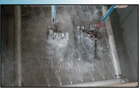
Precisely positioned nozzles and spray manifolds deliver high volume force for maximum cleaning