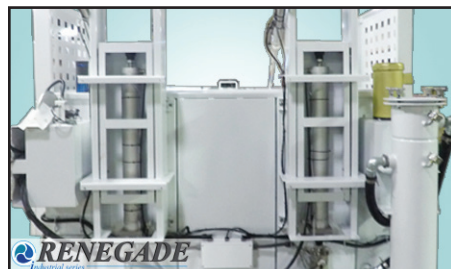
Dual Lift Pneumatic Mechanism.