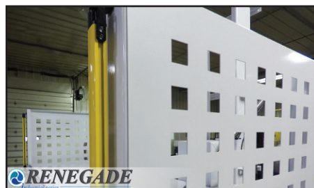
Safety Light Curtain with side door guards.