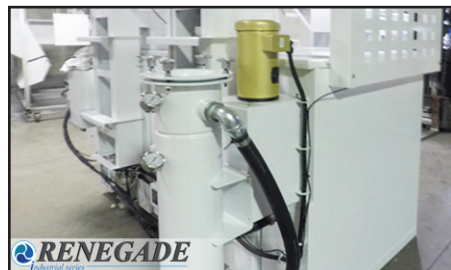
Pump Motor and Filtration System.