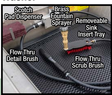
Sink Wash Zone