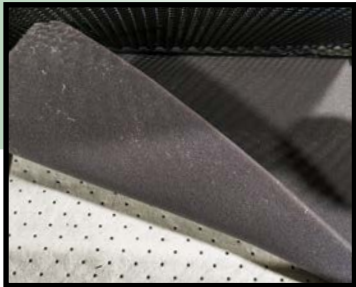
Removeable Sink Insert Tray with Foam Splash Insert and Oil Towel

The Renegade TMB SERIES Manual Parts Washers for general repair cleaning are the practical alternative to washing parts with solvents. The Renegade TMB 4100 Stainless Steel Manual Parts Washer is a low maintenance, cost effective solution for a variety of industrial and grease-busting applications.