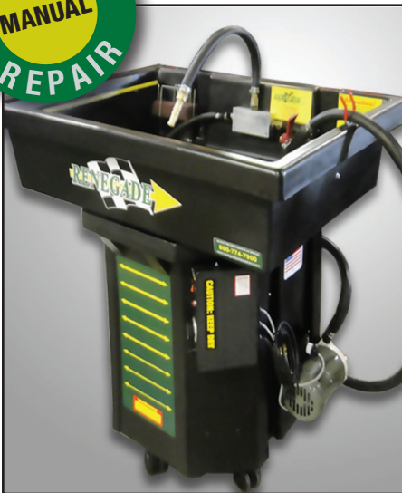
TMB 4000 Outside Dimensions Height: 40-1/2"; Width: 40-1/2"; Depth: 31"; Machine Weight: 189 lbs.