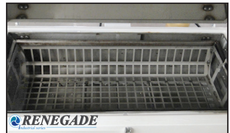
Interior Basket Assembly