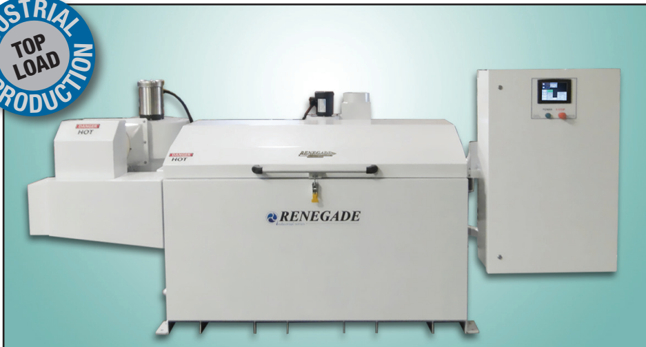
Renegade I-Series TL 60 WD Dimensions: Height: 46.5 inches; Width: 82.5 inches; Depth: 49.5 inches