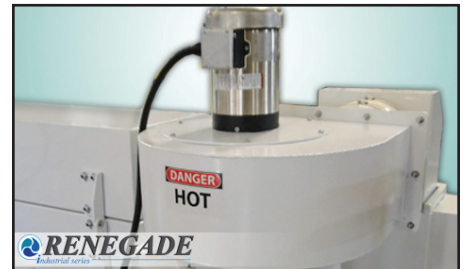
Dry Cycle Blower