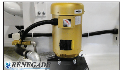
5 HP Heavy Duty Pump Motor