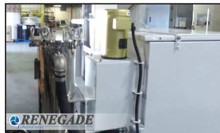
Pump Motor and Filtration System