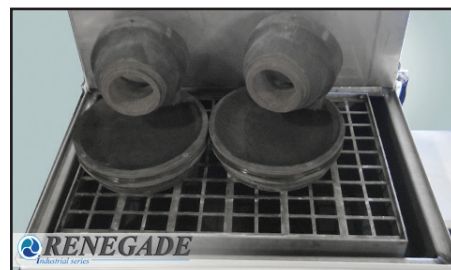
Wash Platform with 550 lbs. Lift Capacity