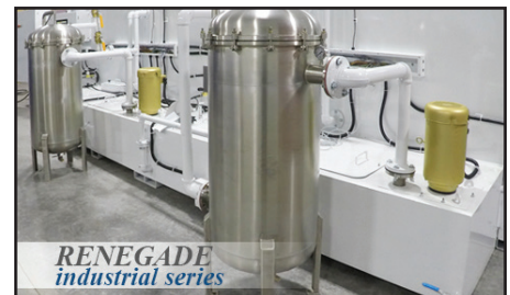
One 6-Bag Filter Assembly and One 15 HP Heavy Duty Pump for each Wash and Rinse Cycle; Power Vent for rapid steam removal.