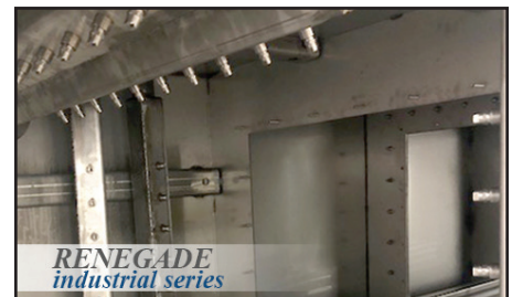
Precisely Positioned Nozzles and Spray Manifolds for upper, lower, and side direction deliver high volume force for maximum cleaning. Heated Dry Cycle.