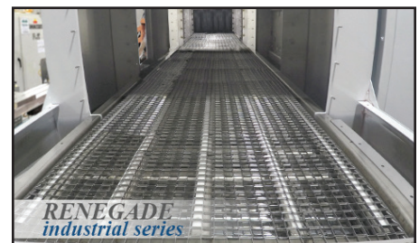
Rugged variable-speed Flat Wire Belt conveyor system.

I-Series CCS 3624B WRD SS PASS THROUGH PARTS WASHER Rev. 12-2018 Cycle times will vary depending on production cell operations, part size, part shape, part weight, and product supply. Subject to changes and modifications without notice.