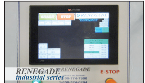
Large, user-friendly HMI/PLC Control Panel