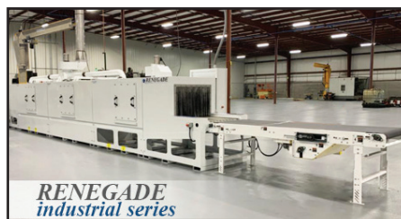
Renegade Pass Through Parts Washer shown with External Conveyor.