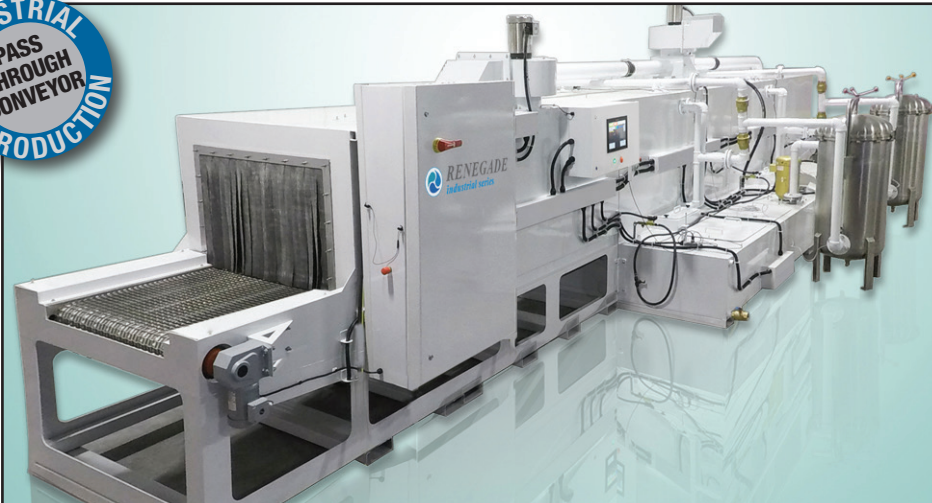
Renegade I-Series Multiple Stage Pass Through Washer WRD Dimensions: Length: 39' 6"; Height: 9' 3"; Depth: 11' 1/2"