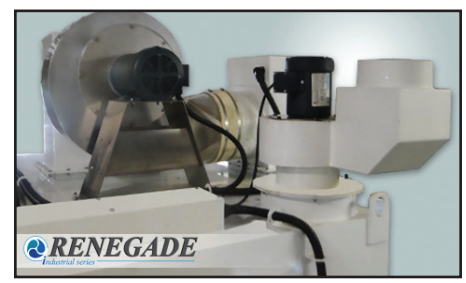
Dry Cycle Blower and Exhaust