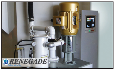
30 HP Heavy Duty Pump Motor