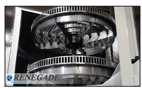
OPTION: Dual Turntables

I-Series 6048 WD Rev. 11-2016 *Estimated average range. Cycle times will vary depending on production cell operations, part size, part shape, part weight, and product supply. Subject to changes and modifications without notice.