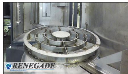
Door-Mounted, Heavy Duty, Gear Driven Turntable, with Oscillating Spray Manifold.