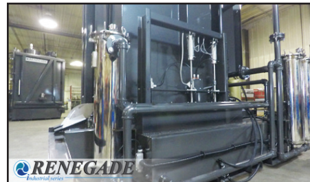
OPTION: Closed Loop Wash Rinse Cycle with Pneumatic Actuator Duplex Filtration for Wash Cycle