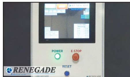
Large, User-Friendly HMI Control Panel