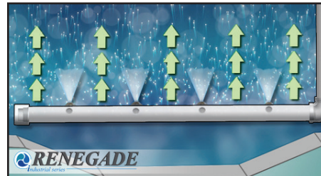
OPTION: Renegade Sump Sweep Spray Manifold directs particulates toward pump for more thorough filtration and suspends particulates to reduce sediment. Extends use of soap/water solution to reduce sediment cleanup.