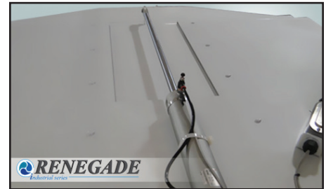
Crane Access Hatch