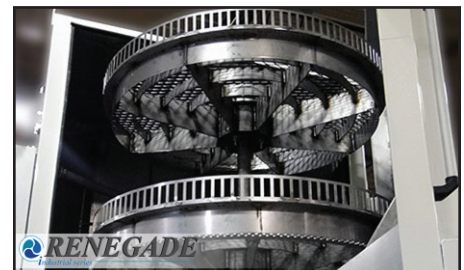
OPTION: Dual Turntables