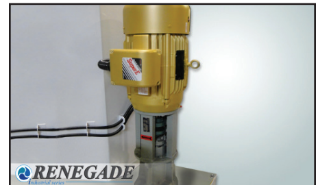
Heavy Duty 30 HP Wash Cycle Pump Motor