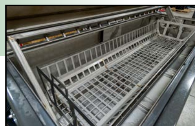
Interior Basket Assembly with Oscillating Spray Manifold