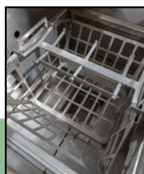
Interior Basket Assembly