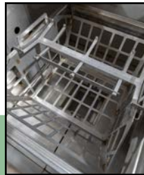
Interior Basket Assembly