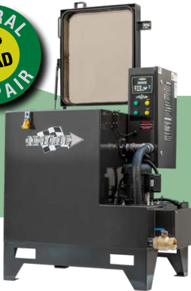
TMB 5500 Dimensions Height: 54-1/2 inches; Width: 43 inches; Depth: 31 inches