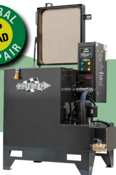
TMB 5500 Dimensions Height: 54-1/2 inches; Width: 43 inches; Depth: 31 inches