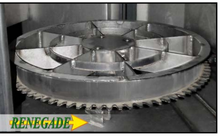
Heavy Duty Gear-Driven Turntable Assembly