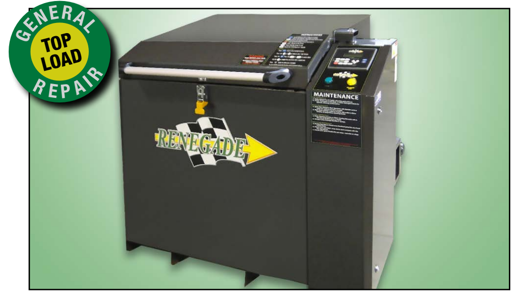
TMB 2614 Dimensions Height: 45" inches; Width: 44-1/2" inches; Depth: 51-1/2" inches