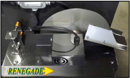
Oil Skimmer and Low Water Safety