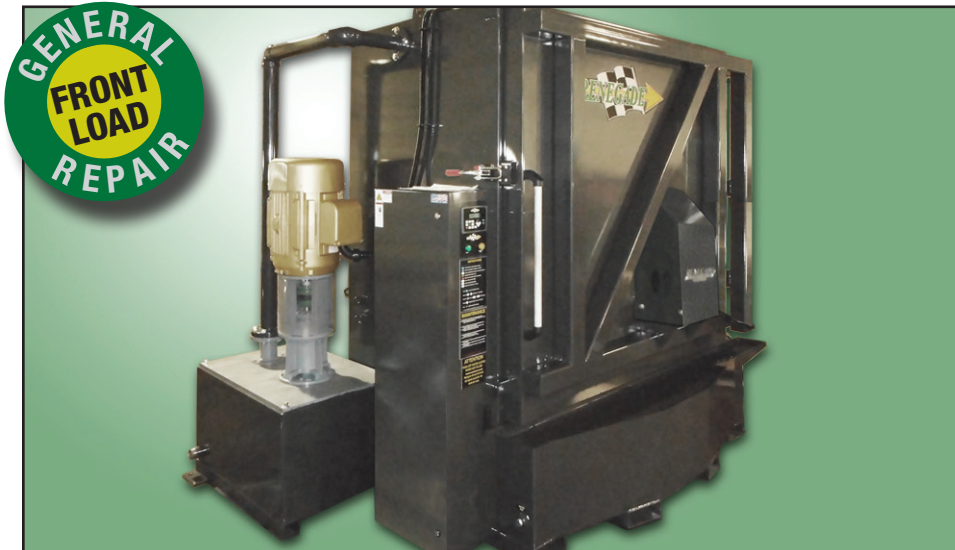
FL 9000 6048 Dimensions Height: 102.5 inches; Width: 111.5 inches; Depth: 83.5 inches

Renegade Model FL 9000 6048 with 30 HP Wash Cycle Pump and 360 Gallon Sump Capacity