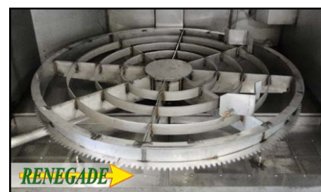
Heavy Duty Gear-Driven Turntable Assembly

The Renegade FL 9000 5080 Front Load Heavy Duty Aqueous Parts Washer is the solvent-free cleaning solution for production cleaning operations such as engine and transmission machining facilities. Renegade automatic front load cabinet washers operate with a durable gear-driven turntable and provide easy access to the wash zone. Your parts will be thoroughly cleaned of grease, oil or lubricants in a high temperature and high pressure environment. Pump and heater capacities are integrated to the load and sump capacities for best throughput. Automation features include automatic low water level shutdown, 7-day programmable wash timer and PLC programmable wash cycle timer. Automatic Front Load Parts Washers maximize efficiency in day to day production cell operations. Renegade Aqueous Parts Washers are designed to work with Renegade detergents for maximum cleaning without residue buildup.