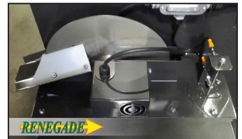
Oil Skimmer and Low Water Safety