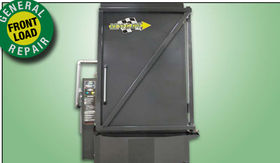
FL 9000 5080 Dimensions Height: 134.5 inches; Width: 84 inches; Depth: 71 inches