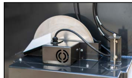
Oil Skimmer and Low Water Safety