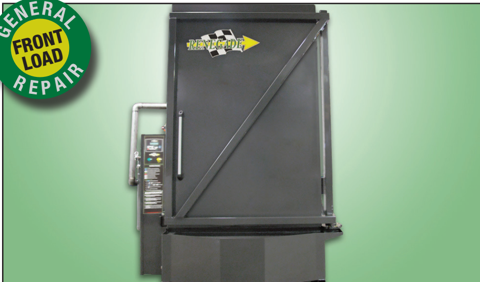
FL 9000 5080 Dimensions Height: 134.5 inches; Width: 84 inches; Depth: 71 inches