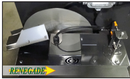
Oil Skimmer and Low Water Safety