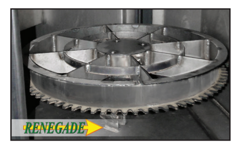
Heavy Duty Gear-Driven Turntable Assembly