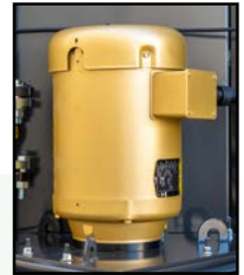
High Efficiency Pump Motor