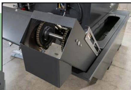
Optional Sludge Conveyor

FL 9000 4080 Dimensions Height: 133.5 in.; Width: 97 in.; Depth: 72 in. Shown with Optional Turntable Fixture