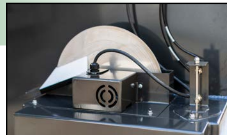
Oil Skimmer and Low Water Safety