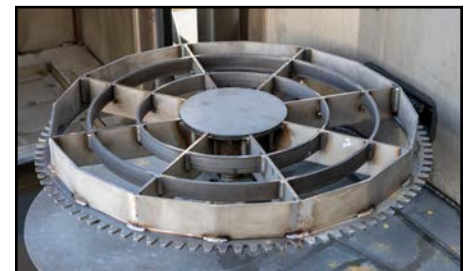
Heavy Duty Gear-Driven Turntable Assembly. Door-Mounted for Easy Load Access.