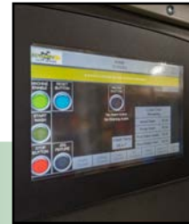
Optional 7" HMI Control Panel

FL 9000 4080 Dimensions Height: 133.5 in.; Width: 97 in.; Depth: 72 in. Shown with Optional Turntable Fixture