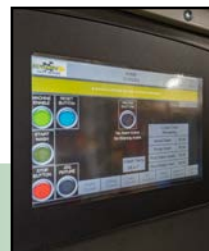
Optional 7" HMI Control Panel

FL 9000 4080 Dimensions Height: 133.5 in.; Width: 97 in.; Depth: 72 in. Shown with Optional Turntable Fixture