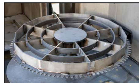
Heavy Duty Gear-Driven Turntable Assembly. Door-Mounted for Easy Load Access.