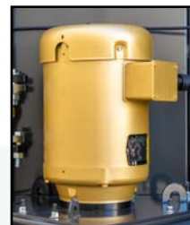
High Efficiency Pump Motor