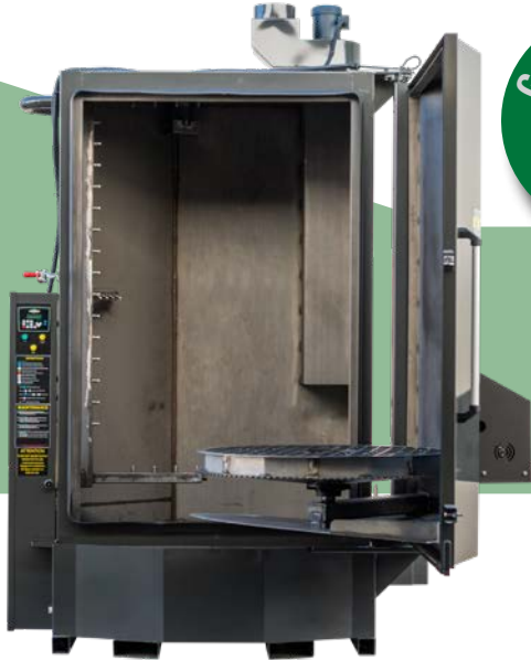
Shown with Optional Power Vent

Renegade Model FL 9000 4060 with 10 HP Wash Cycle Pump and 190 Gallon Sump Capacity