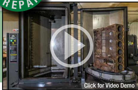
FL 9000 4060 Dimensions Height: 100.5 inches; Width: 78 inches; Depth: 61 inches