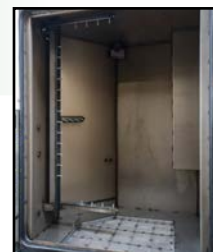
Heavy-Duty Spray Manifold