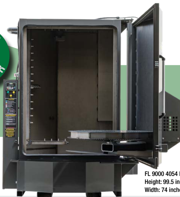
FL 9000 4054 HD Dimensions Height: 99.5 inches; Width: 74 inches; Depth: 61 inches