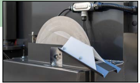
Oil Skimmer and Low Water Safety