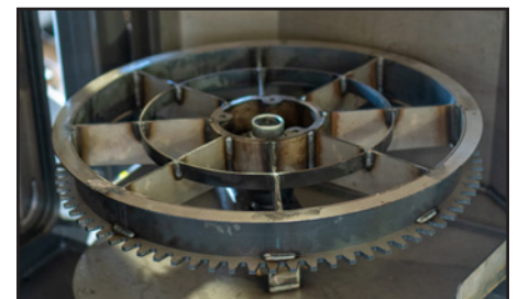
Heavy Duty Gear-Driven Turntable Assembly. Door-Mounted for Easy Load Access.