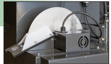
Oil Skimmer and Low Water Safety