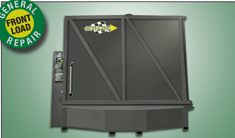
FL 9000 12070 Dimensions Height: 125 inches; Width: 168.5 inches; Depth: 153 inches.