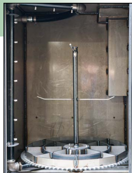
Spray Manifolds and Heavy Duty Gear-Driven Turntable Assembly with Optional Parts Tree Fixture