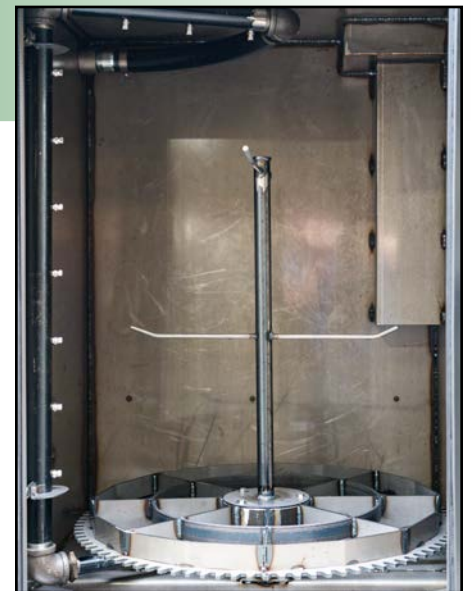
Spray Manifolds and Heavy Duty Gear-Driven Turntable Assembly with Optional Parts Tree Fixture