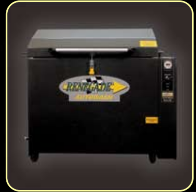
TMB 8000 Stretch